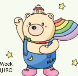
The mascot for KG Rainbow Week NIJIRO

May 17 th (FRI) 18:30 - 20:00 at the at Lambuth Memorial Chapel on Nishinomiya Uegahara Campus